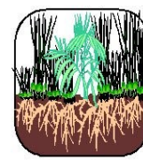
The Weedy Soil