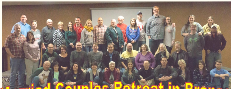
Married Couples Retreat in Branson