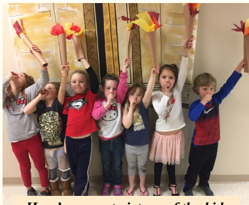
Here’s a sweet picture of the kids in our first grade class with their torches after studying Gideon. Thanks Gena for the picture.

THEREFORE ENCOURAGE ONE ANOTHER AND BUILD ONE ANOTHER UP JUST AS YOU ARE DOING 1 THESSALONIANS 5:11